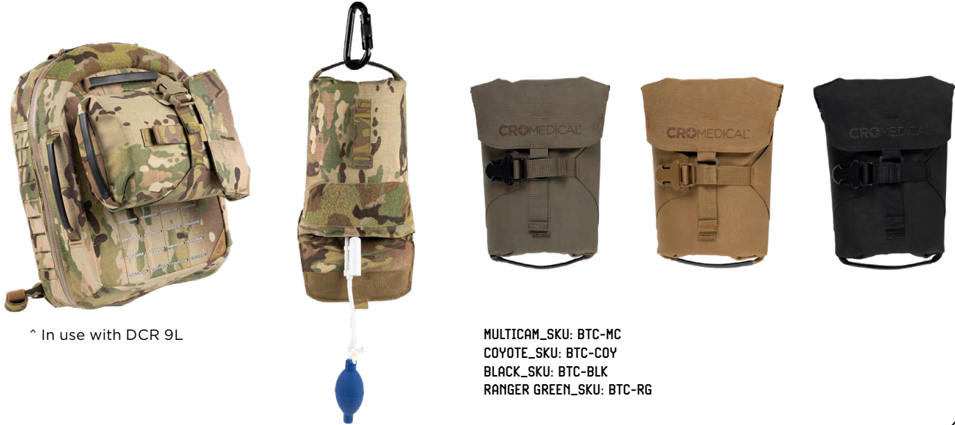
^ In use with DCR 9L

Single-unit blood container featuring a built-in pressure infuser.