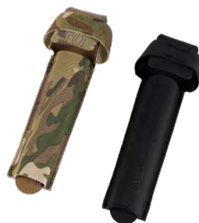
FULL TQ COVER