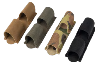
RAID TQ COVER