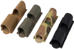
RAID TQ COVER