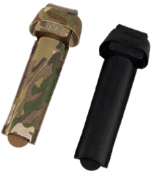
FULL TQ COVER

ECAT_ #SPE2DE-20-D-7032 DAPA_ #SP0200-10-H-0092 FEDMALL_ SP47W1-21-D0038 GSA_ GS-07F-5965P (SCHEDULE 84)